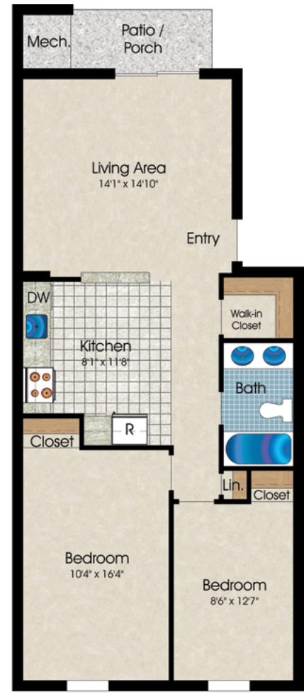
2 Bedroom | 1 Bathroom